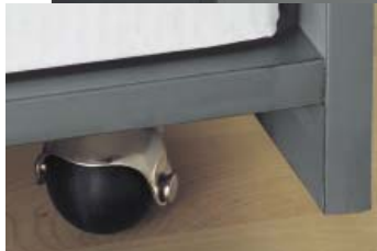
Mounted on 4 locking casters for easy mobility