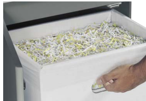
Easy emptying: pull out the entire bin - no messes