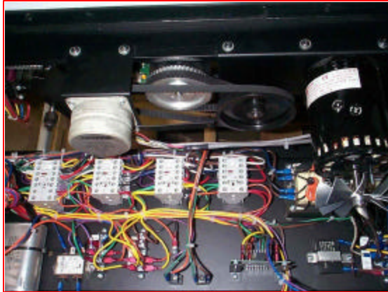
Powerline electrical system, front deck removed